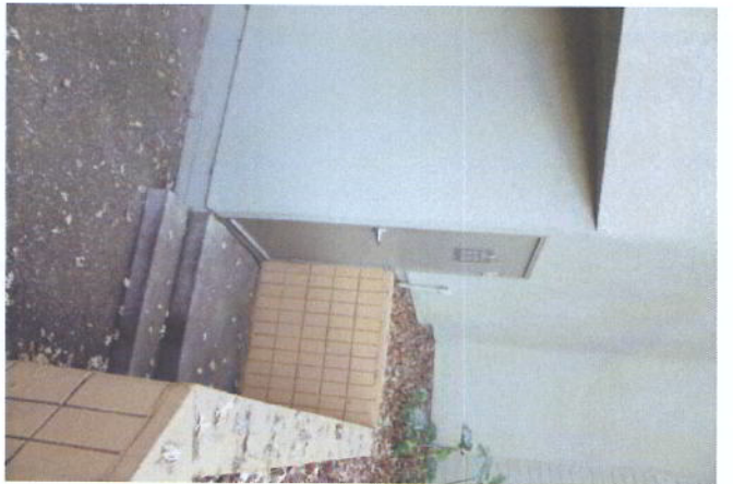
Photo 12 - Apartment entries.