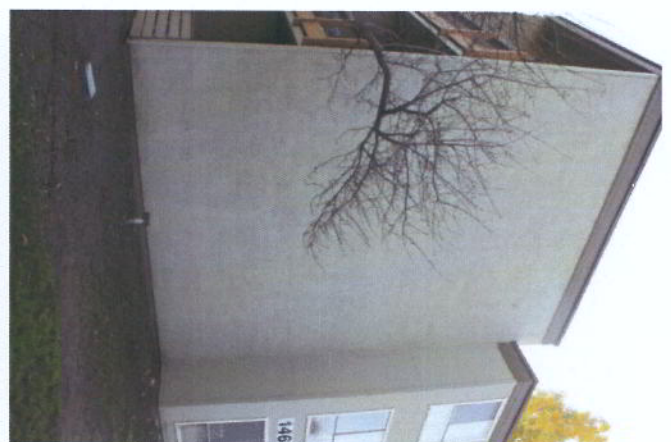
Photo 4 - Exposed building wall.