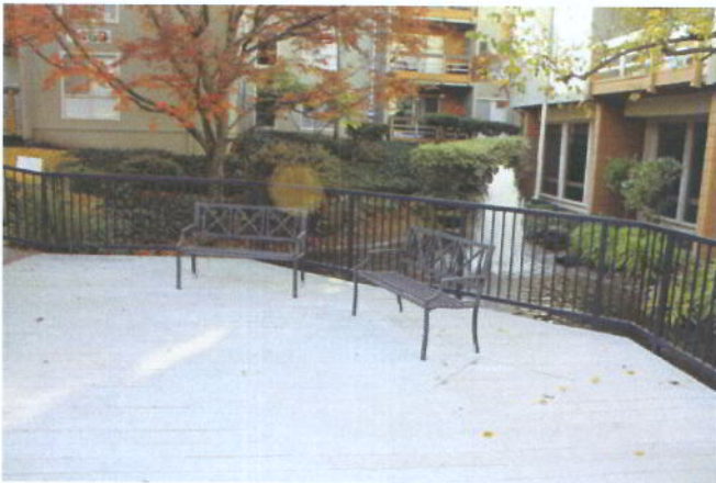
Photo 15 - Poorly placed benches, brightly toned decking.