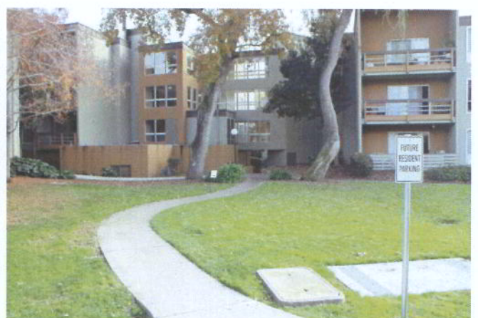
Photo 6 - Narrow, meandering entry walk.