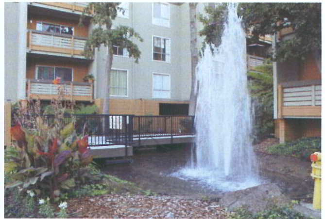
Photo 20 - High volume fountains at pedestrian entry.