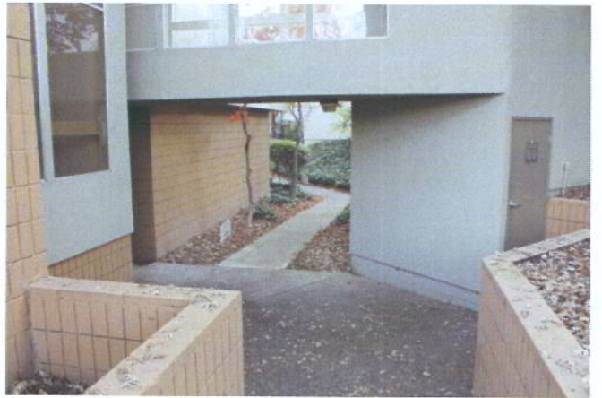
Photo 10 - Cameo view/walkway to pool area with light fixture.