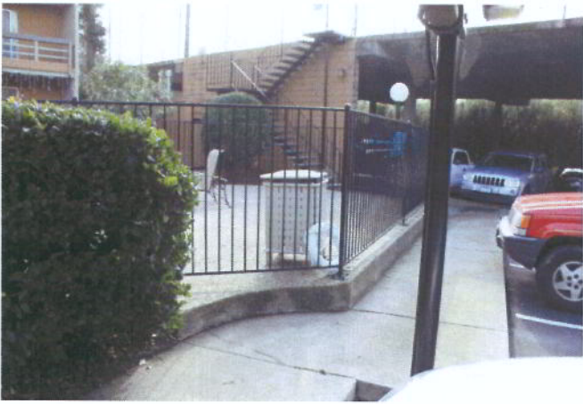
Photo 7 - Spa feature adjacent to rental office walkway.