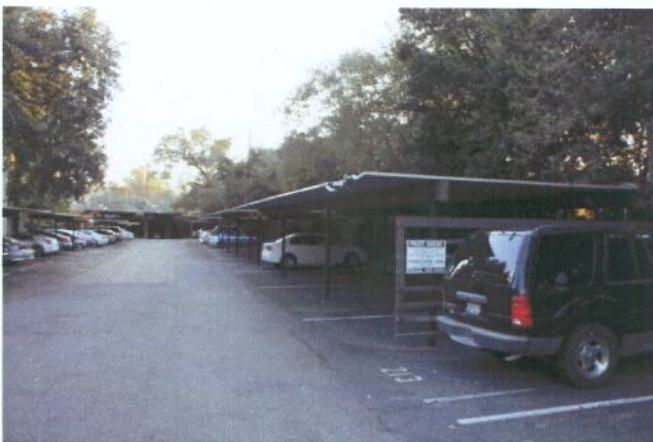
Photo 3 - Carports in poor repair.