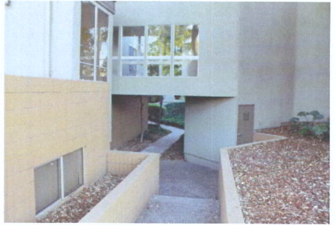
Photo 8 - Narrow, uninviting entry stairs.