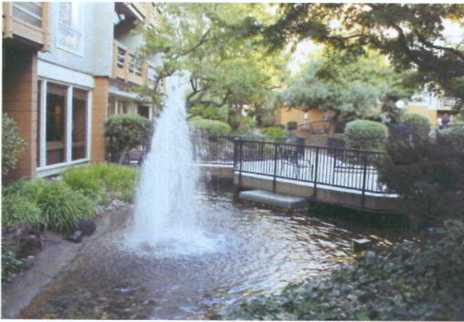
Photo 13 - Fountain outside gym entrance.