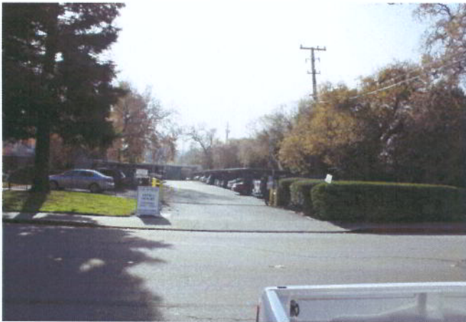
Photo 1 - View at main entry.