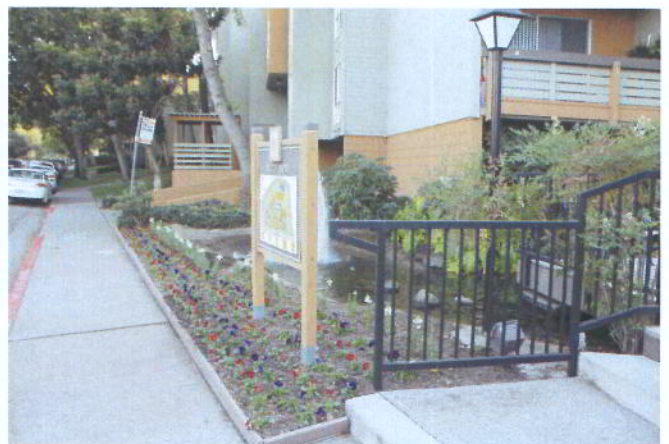
Photo 22 - Annuals at entry with poor header.