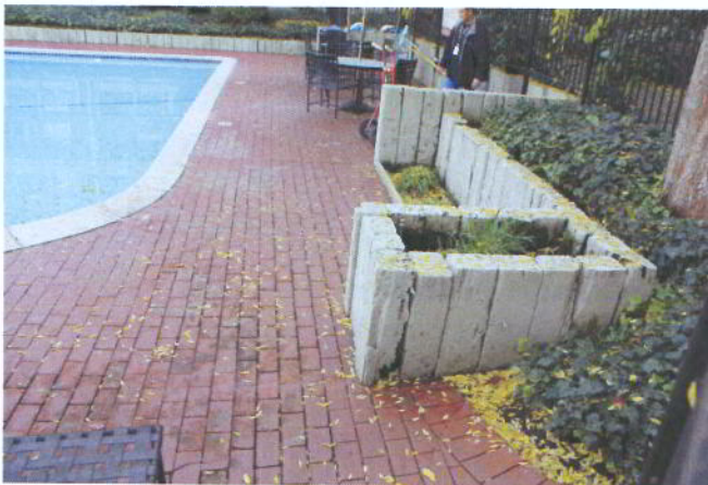
Photo 17 - Failing retaining and planters at pool.