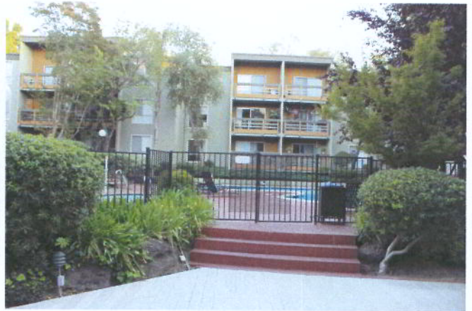
Photo 16 - Entry to pool could be enhanced.