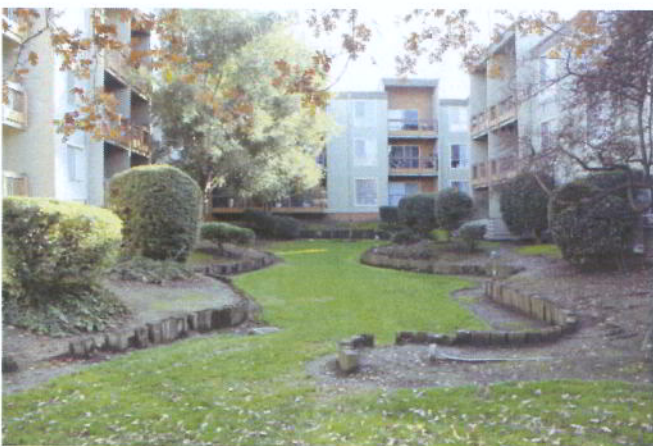
Photo 5 - Failing timbers at dog walk.