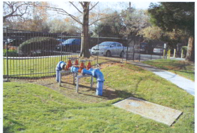
Photo 2 - Backflow device at entry.