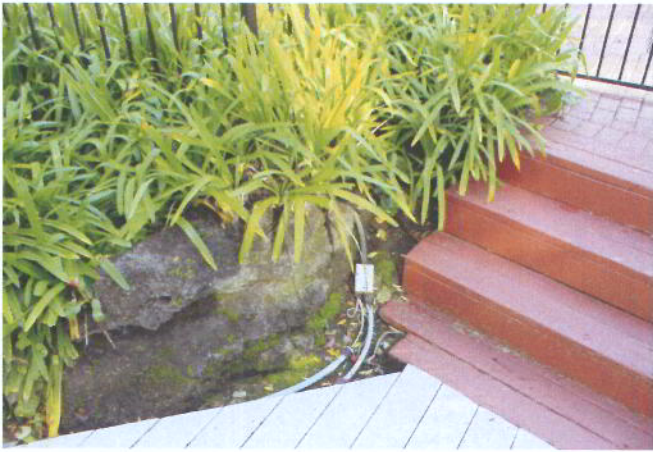
Photo 19 - Conduit with exposed wiring.