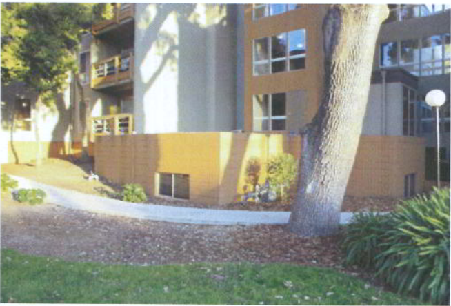
Photo 9 - Unattractive utility building at rental office walkway.