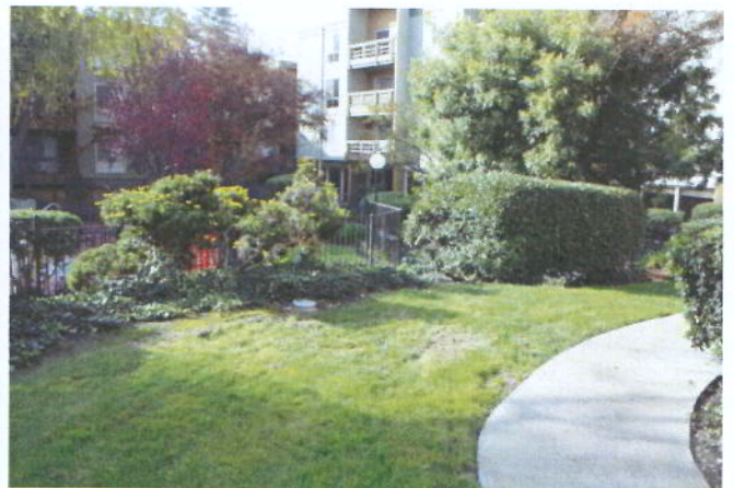
Photo 18 - Lawn area above pool could be better utilized.