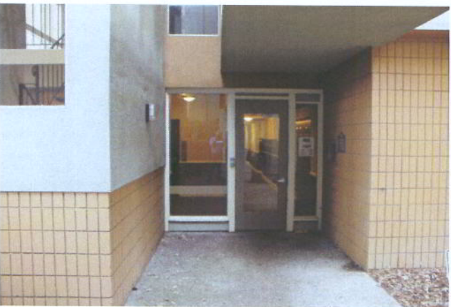
Photo 11 - Narrow 'canyons' of space.