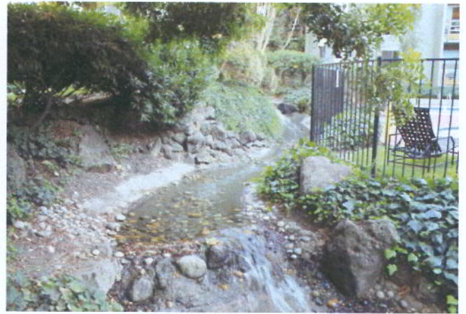
Photo 14 - Watercourse with unvaried flow.